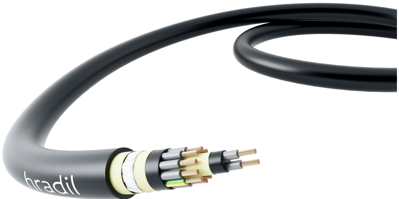
Fig. 2: HRADIL Offshore power cable for highly explosive environments

NEK TS 606 is a Technical Specification created by the Norwegian Electrotechnical Committee for the marine and offshore industry and defines the requirements for halogen free and mud resistant cables. The requirements of NEK TS 606 are much more demanding compared to IEC 60092-360: 2014.