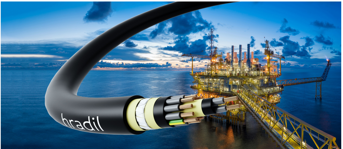
Fig. 1: HRADIL offshore power cable for highly explosive environments

The HRADIL offshore power cable was specially designed to ensure the smooth operation of electrical systems in extremely harsh maritime environments with explosive atmospheres typically found on oil platforms or petroleum or natural gas tankers for example. The cable excels in applications such as cranes and hoisting or lifting equipment. The HRADIL offshore power cable is resistant against oil and petroleum, ozone and UV radiation as well as against cooling fluids, lubricants and cold cleaning agents.