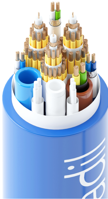
Fig. 4: Drum-reeling hybrid cable by HRADIL Spezialkabel for the chemical and construction industry - cross-section