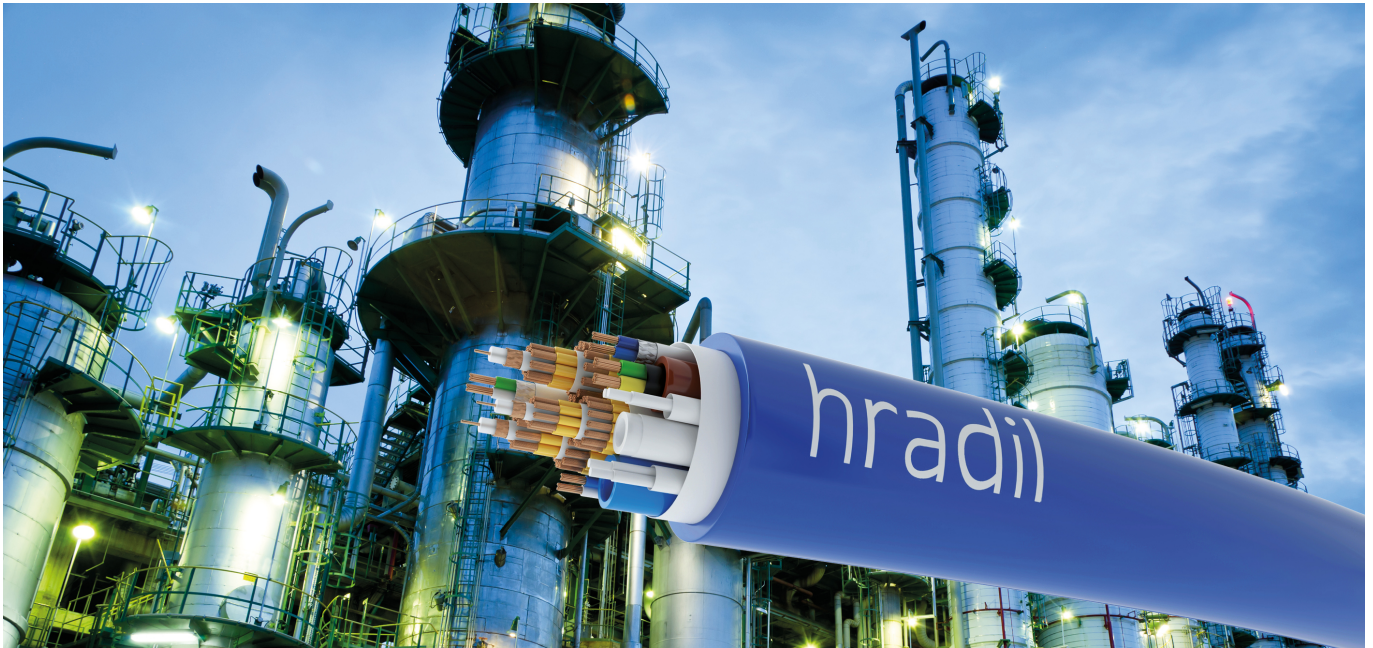
Fig. 1: Drum-reeling hybrid cable by HRADIL Spezialkabel for the chemical and construction Industry

„Industrial users today have come to expect ever more versatility from a cable” as Alfred Hradil, Managing Director at HRADIL Spezialkabel knows from experience. To save costs, maintenance efforts and space, different functions that in the past were performed by several different cables, today are united in one hybrid cable. However, this can only be achieved where solutions have been found which in terms of engineering, design and choice of material permit the combination of multiple purposes in a single cable.