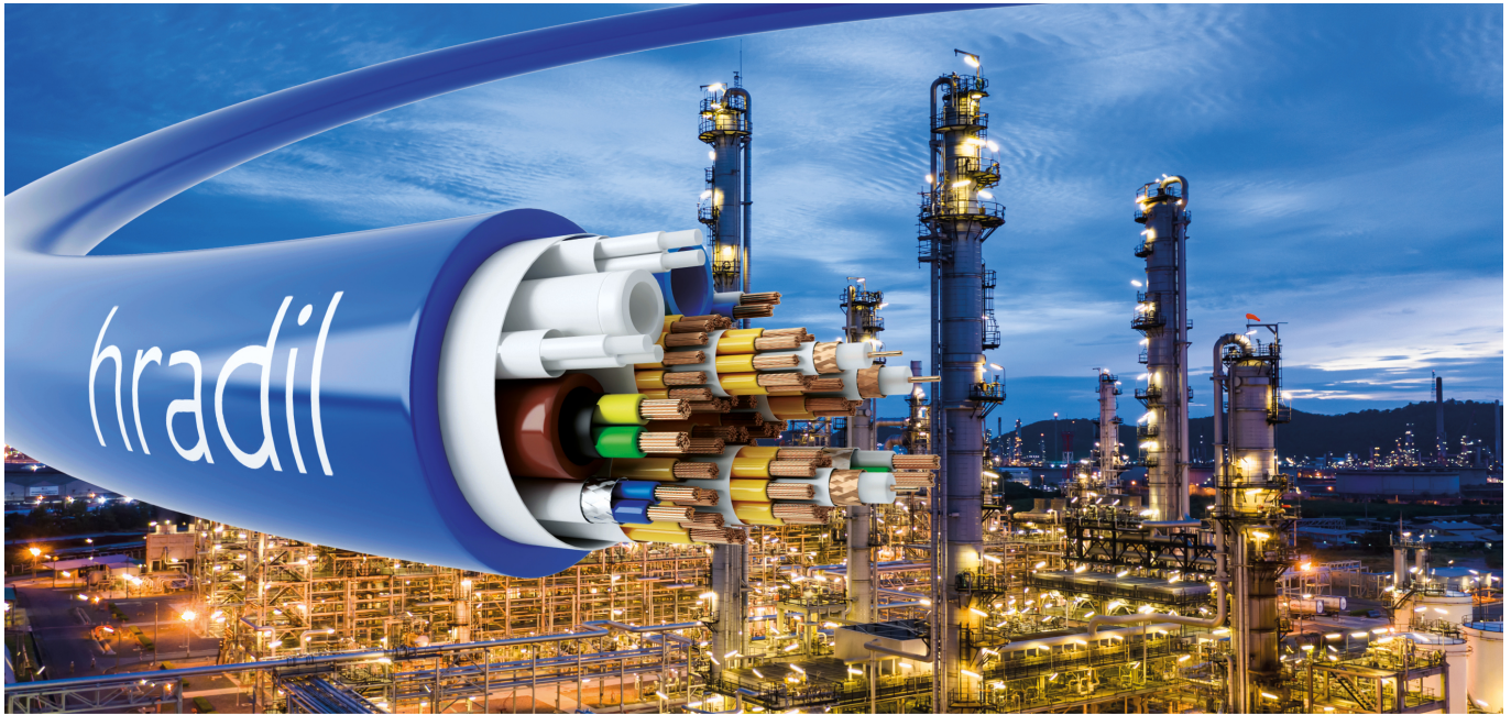
Fig. 2: Drum-reeling hybrid cable by HRADIL Spezialkabel for the chemical and construction industry

HRADIL now present a hybrid cable that brings together four capabilities or functions in a single cable: Ethernet in accordance with category 7 for the transmission of real-time data, power transmission up to 1,000 volts, real-time control tasks thanks to the CAN Bus, image and video data using the coax and the fibre-optic cables to transmit signal and control signals at very high data transmission rates. Furthermore, the hybrid cable was designed to survive robust outdoor usage over several years even in the harshest climate conditions and it excels in drag chain applications where it withstands extreme tensile and torsional loads.