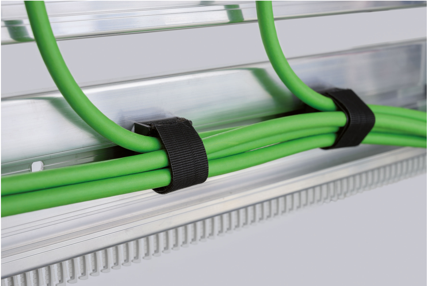
Fig. 2: For specific horizontal installation of data and control cables.